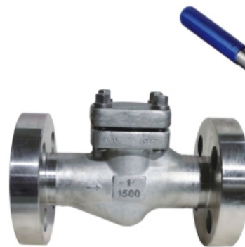
Bolted Bonnet Check Valve