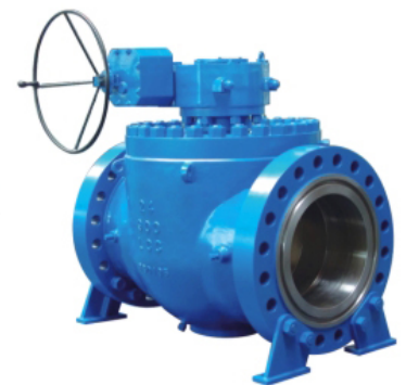
Top Entry Trunnion Mounted Ball Valve