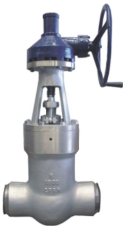
Pressure Seal Bellow Gate Valve