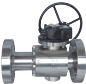
Forged Steel Trunnion Mounted Extended Bore Ball Valve