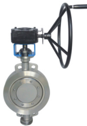
High Performance Butterfly Valve