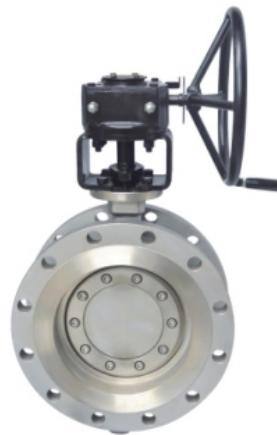
Gear Box Metal-To-Metal Triple Offset Butterfly Valve