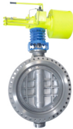
CF8C Pneumatic and Hydraulic Metal-To-Metal Triple Offset Butterfly Valve