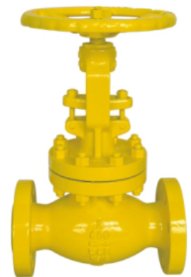
Carbon steel Globe Valve Class 600