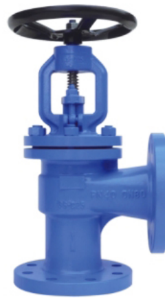
Angle Globe Valve