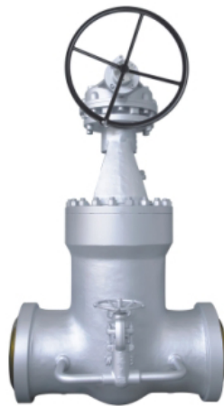
Pressure Seal Gate Valve With Bypass Valve