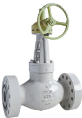
High Pressure Globe Valve Class 2500