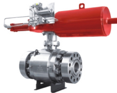
Trunnion Mounted Ball Valve With Hydraulic Actuator