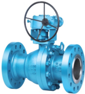
Cast Steel Floating ball valve