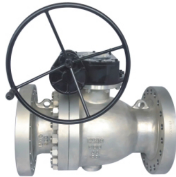
Cast Steel Trunnion Mounted Ball Valve