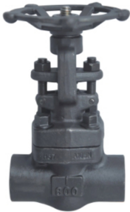
Forged Steel Butt Weld Gate Valve