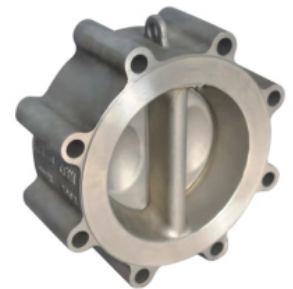
Lug Dual Plate Check Valve