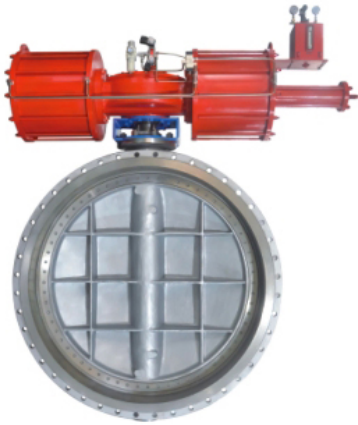
CF3M Pneumatic and Hydraulic Metal-To-Metal Triple Offset Butterfly Valve