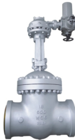
Motorised Pressure Seal Gate Valve