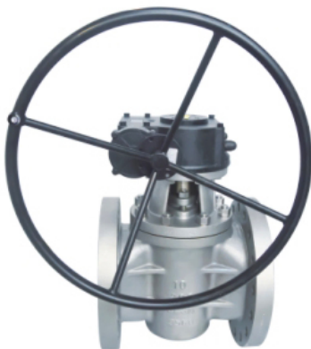
Gear Box Plug Valve