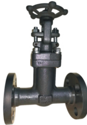
Forged Steel Bellow Pressure Seal Bellow Gate Valve