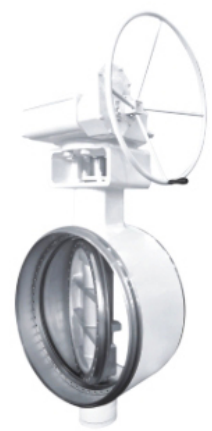
Replaceable Metal to Metal Seated Butterfly Valve