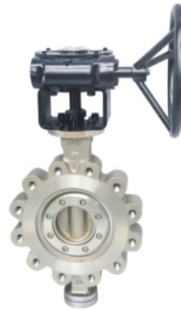
Lug CF3 Triple Offset Butterfly Valves