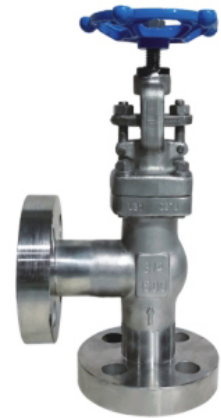
Forged Steel Pressure Seal Globe Valve