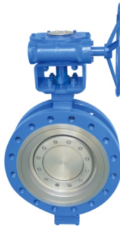
Gear Box Triple Offset Butterfly Valve