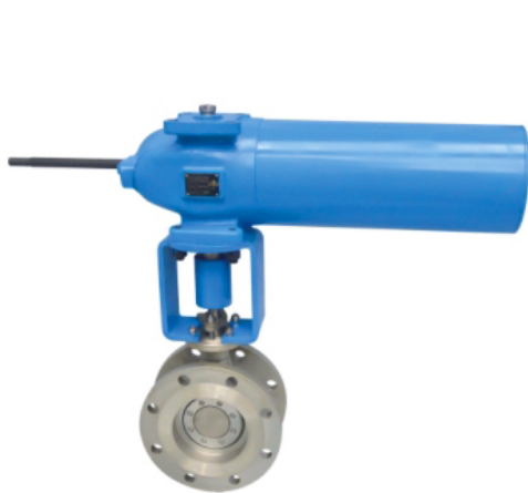
Pneumatic Metal-To-Metal Triple Offset Butterfly Valve