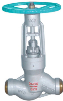
Pressure Seal Globe Valve