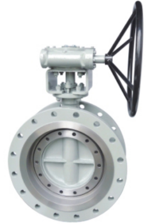
CF8 Gear Box Triple Offset Butterfly Valve