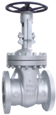
Wedge Carbon Steel Gate Valve