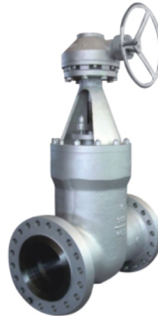
Pressure Seal Flanged Gate Valve