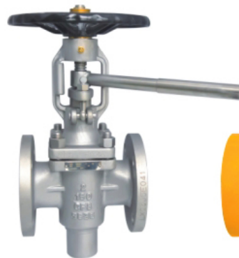
Plug Valve With Handwheel And Lever