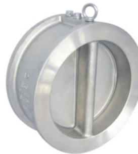
Wafer Dual Plate Check Valve