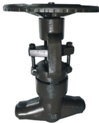
Forged Steel Butt-Welded Pressure Seal Globe Valve