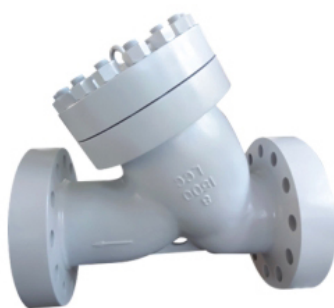
Y Strainer Class 1500 Flanged End