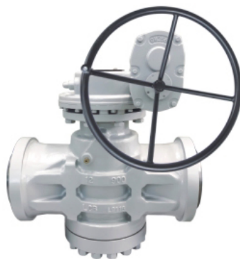
Gear Box Plug Valve