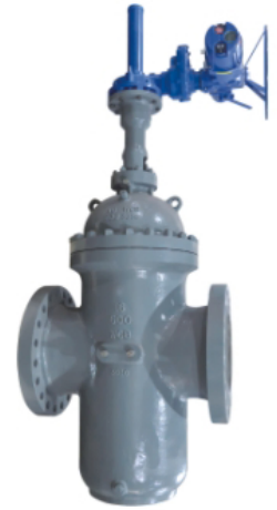
API 6D Gate Valve