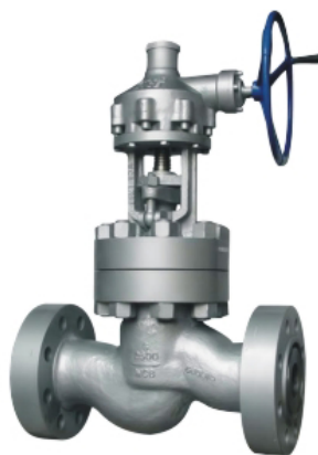
High Pressure Globe Valve Class 2500