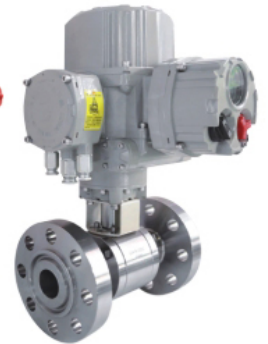
Motorised Forged Steel Trunnion Mounted Ball Valve