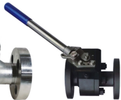
Auto-reset Handle Ball Valve