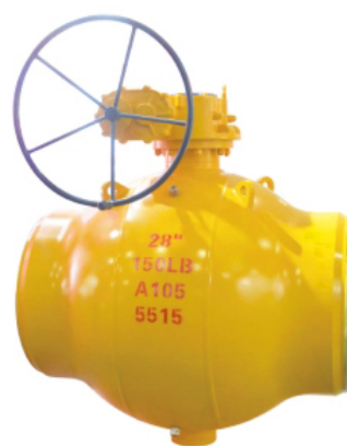
Full-welded Ball Valve