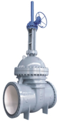
Gear Box Wedge Carbon Steel Gate Valve