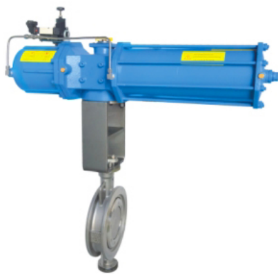
High Temperature Triple Offset Butterfly Valve