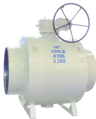
Full-welded Ball Valve