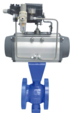
V-type Ball Valve