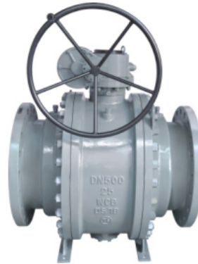
Cast Steel Trunnion Mounted Ball Valve