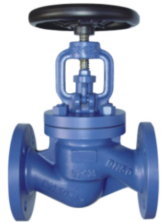
ANSI Bellows Globe Valve