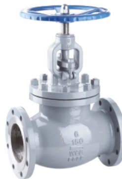
Carbon steel Globe Valve Class 150