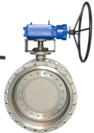
CF8M Gear Box Metal-To-Metal Triple Offset Butterfly Valve