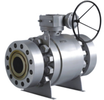
Forged Steel Trunnion Mounted Ball Valve