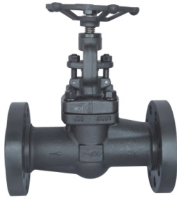
Forged Steel Flanged Globe Valve