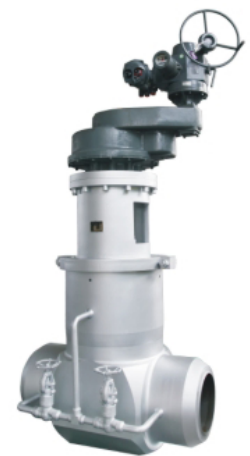
Motorised Pressure Seal Gate Valve With Bypass Valve