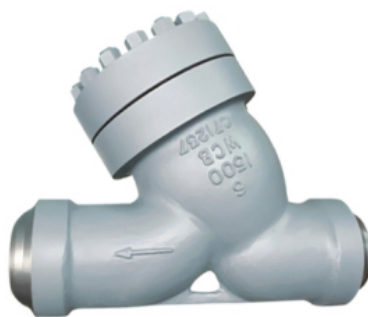
Y Strainer Class 1500 Butt Welded End