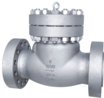
Industrial Swing Check Valve