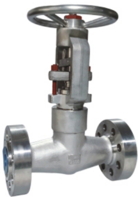
Forged Steel Pressure Seal Globe Valve