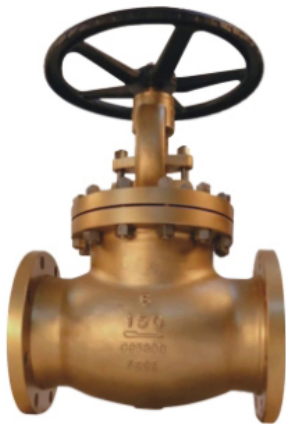
Aluminium Bronze Globe Valve