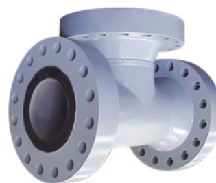
T-Strainers Flanged End