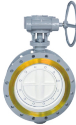
WCB Gear Box Triple Offset Butterfly Valve