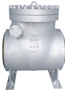
Swing Check Valve